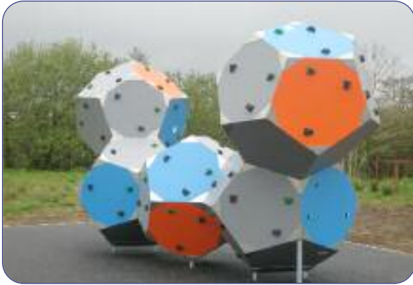
Climbing Wall at Doorly Park – provided by RAPID Dormant Accounts Funding in 2009.