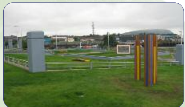
Art at Salmon Amenity Area.

In 2009 the Public Art commissions series Unravelling Developments concluded having produced 10 art projects in the county and city. These projects were funded solely by the Department of the Environment, Heritage and Local Government "Per Cent for Art Scheme". The commissions involved significant levels of community involvement, which proved to be very popular. Feedback from the public confirmed that the projects completed are of high artistic quality and capture distinctive aspects of Sligo.