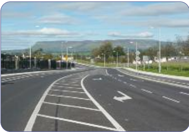
Western Distributor Road looking North.

The Compulsory Purchase Order for Phase 2 of the Western Distributor Road Scheme will be published in 2010. On completion, this scheme will provide access to the IDA Business Park at Finisklin, the proposed IDA Business Park at Oakfield, zoned residential land, Strandhill Airport, western areas of Sligo and the community sports and Park facilities, from the N4 dual carriageway, the main north-south road corridor through Sligo City. The development will eliminate the need to access all of the above from the City centre, thus reducing journey times and congestion in the city centre. The development will also relieve traffic congestion on existing roads on the western side of Sligo and improve access to and from the area for existing residents.