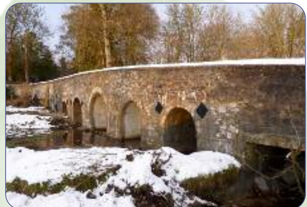
Foyouges Bridge - post works 2009.