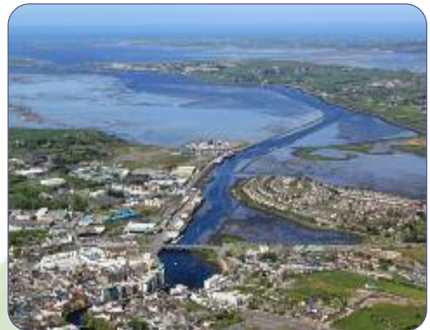
Shell fish Waters - Sligo Bay.

Increased catchment management surveys will be required in these particular catchment areas into the future in order to bring about improvements in water quality as required by the Pollution Reduction Programmes. The Pollution Reduction Programmes may be reviewed at intervals to determine if additional actions or measures are required.