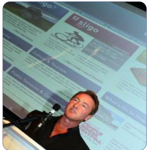
Launch of website www.sligo.ie

Websites: www.sligococo.ie , www.sligoborough.ie