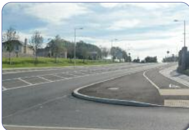
Western Distributor Road looking south from Mitchell Curley Park Entrance.