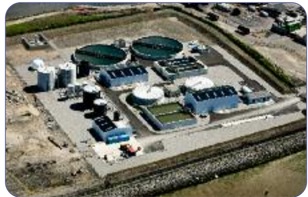
Sligo Wastewater Treatment Plant.

This new Wastewater Treatment Plant (50,000pe), Pumping Station and Sludge Hub Centre at Finisklin, Sligo was completed during 2009. The total project cost was €37M. The plant is now fully operational and the 2010 operation and maintenance costs will be approximately €1.2M.