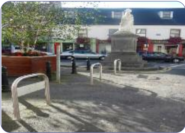
Bicycle Parking at Market Cross.

In April 2009, Sligo County Council applied for funding under European Mobility Week for the permanent re-allocation of road space to pedestrians, cyclists and public transport. Sligo County Council was one of nine successful Local Authorities to receive funding under this scheme. A total of €39,000 was spent on the conversion of Vehicle Parking Bays to Bicycle Parking Bays and the conversion of existing road space to Bus Bays along Sligo City Commuter Routes. Bicycle Parking was provided at Market Cross (3No), Wine St Car Park (4No), Quay St Car Park (2No), Hyde Bridge (2No), Stephen St Car Park (2No) and St Anne's Car Park (2No). Bus Bays were provided at Ballytivnan Road (2No), Doorly Park Road (1No) and Cleaveragh Drive (2No). All work was complete by European Mobility Week, 16th-22nd September 2009.