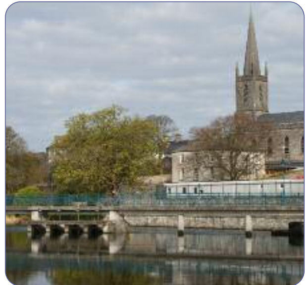
Sean Fallon Bridge.

Health & Safety continues to be an integral element of the Local Authorities undertakings.