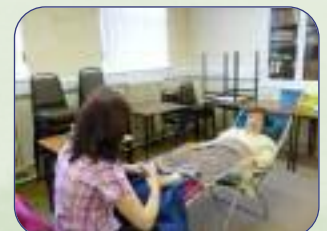
People from a range of active age groups availing of the therapies offered by volunteers.