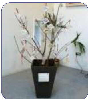
Branching out to Volunteer Tree.

In 2009 Sligo Volunteer Centre held a "Branching Out to Volunteer" event in Tubbercurry. This event gave Sligo Volunteer Centre the opportunity to raise awareness of Volunteer Involving Organisations operating in the Tubbercurry area. It also gave these groups an opportunity to showcase their work & recruit further volunteers. It also assisted in raising the awareness of the services Sligo Volunteer Centre can offer to groups in the Tubbercurry area. This in turn increased the volunteering opportunities available for people interested in volunteering in Tubbercurry. Sligo Volunteer Centre placed a folder with all of the current volunteer opportunities in Tubbercurry Library, which will continue to provide the people of South Sligo with up to date information about all of the opportunities available both in Tubbercurry and around the county. This event was a great success and Sligo Volunteer Centre would hope to repeat this type of event throughout Sligo Town and county.