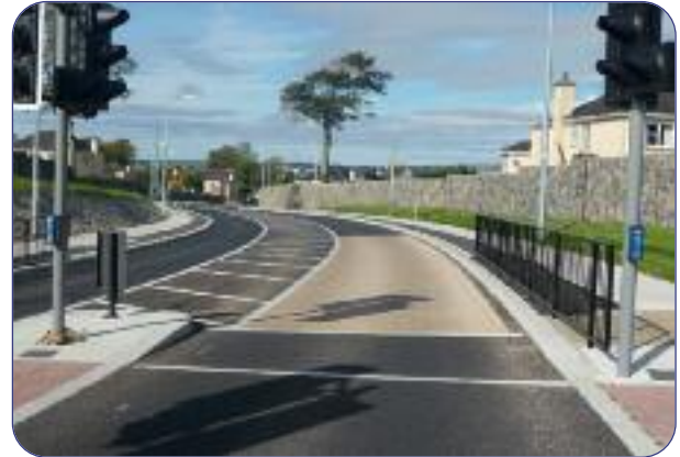
Western Distributor Road at Kevinsfort Heath.