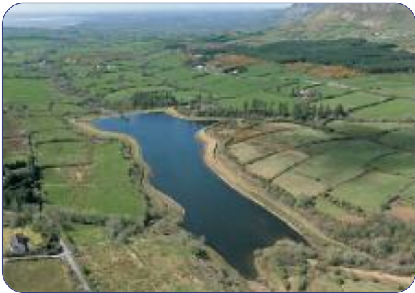
Kilsellagh Water Treatment Plant.

The construction of the new water treatment plant at Kilsellagh has been completed and is now fully operational. It will serve Sligo City and its environs including the Rosses Point peninsula and the North Fringe area. The new plant, which includes a new 2,200m 3 treated water reservoir, will have a maximum throughput capacity of 400m 3 /hr. The estimated DB project cost is €7.8M.