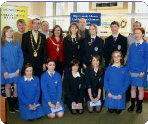
School writing competition at Sligo County Library.