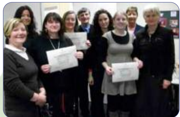
The First Group of participants in Sligo Volunteer Centre's Volunteer Management Training receiving their Certificates from MEP Marian Harkin.