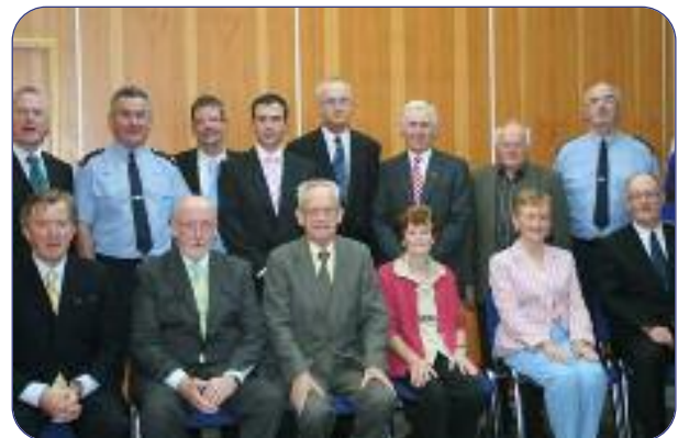
Members of the Sligo County Council Joint Policing Committee.

The Joint Policing Committee is a facilitating body and a forum for discussion. It engages with local communities to the greatest degree possible as they are an important resource in tackling many of the issues currently being addressed by the Sligo County Council Joint Policing Committee.