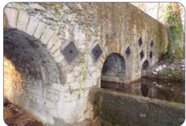
Foyouges Bridge - post works 2009.