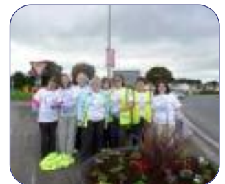
Volunteers getting stuck into the tasks at hand.