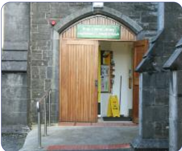
Wheelchair access ramp in place at Sligo Central Library.

Preliminary work has begun in relation to the proposed new Ballymote Community Library . A suitable location on Teeling Street, Ballymote town, has been acquired and work is underway in scheduling contracts to fit out the building. Once completed this fully equipped and accessible Community Library will be among the best in the country providing an extensive up-to-date Book & Audio/DVD collection, Internet and Wifi access, Local History Material and Meeting rooms.