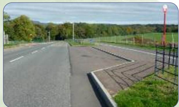
Bus Bays on Cleveragh Drive.

A Local Authority Network was established on the 14 July, 2009 to support the delivery of the Government's Smarter Travel Policy at national and local level. The Network is comprised of a nominated official from each Local Authority and members of the National Sustainable Travel Office of the Department of Transport. Sligo County Council is a member of this network which meets three times a year with meetings of subgroups taking place more frequently throughout the year. The Local Authority Network provides for structured liaison between central and local government to ensure that the Government's vision contained in Smarter Travel is delivered consistently and in accordance with best international practice at local level in Ireland.