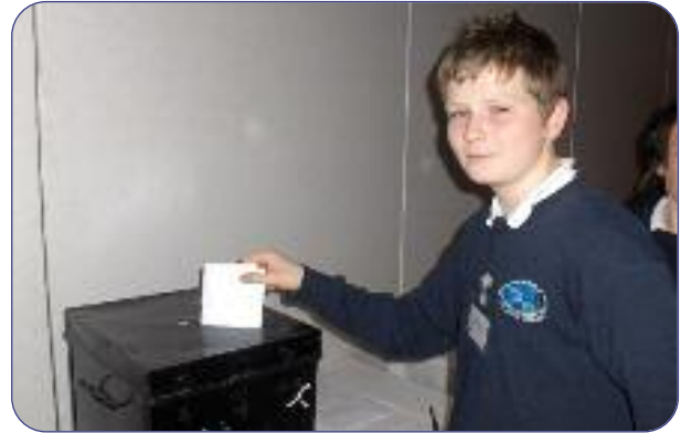
First Vote at Comhairle na nÓg 2009.

The AGM also featured democratic elections to elect 25 young members to form Sligo Comhairle na nÓg for a period of 2 years. During this term they act as the collective voice of young people in County Sligo by lobbying on a range of issues affecting young people today. The elected membership mirrors that of Sligo County Council including the number of Councillors and its electoral areas. Five members of the Comhairle na nÓg were also elected to represent Sligo at the Annual Dáil na nÓg Event in Dublin in March 2010. Elected members of Sligo County Council have been very supportive of the initiative.