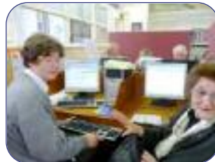
Some GIAS Participants & Volunteers enjoying their Technology Day.