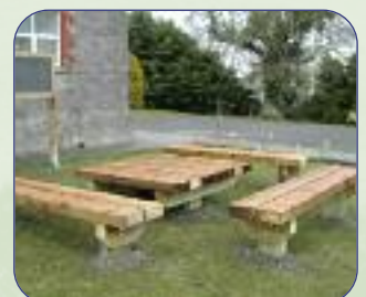
Riverstown Outdoor garden 2009 winner.

Funding of €25,000 was awarded to 12 groups for public education and awareness initiatives on litter and graffiti under the Anti-Litter Anti-Graffiti Awareness Scheme 2009.