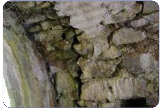
Foyouges Bridge- pre works 2009.

All the above bridge projects were completed in 2009. The works carried out included strengthening, repair and replacement as necessary to bridges supporting public roads, taking cognizance of the built heritage of pertinent structures.