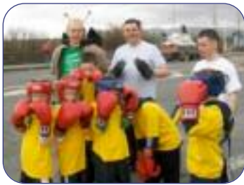
Cranmore Boxing Club