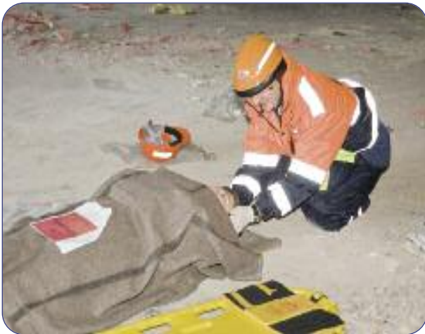
Civil Defence volunteer demonstrates First Aid as part of the training programme.

Strategic plan for Civil Defence for 2010-2013 is currently being compiled and will be introduced in June 2010 outlining Civil Defence hopes and aspirations for the next three years.