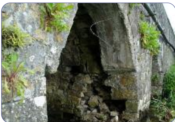
Foyouges Bridge- pre works 2009.