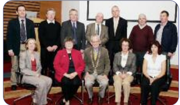
Forum members and guests at website launch.